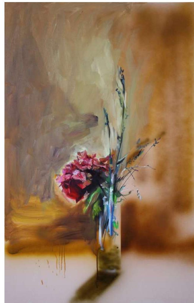
Kalam e gol (47,2 x 23,6 in) oil and acrylic on canvas

His work questions the place and the ways the human being is incarnated as a central figure in contemporary painting. This research led him to explore shapes with stories and vice versa in a perpetual renewal.