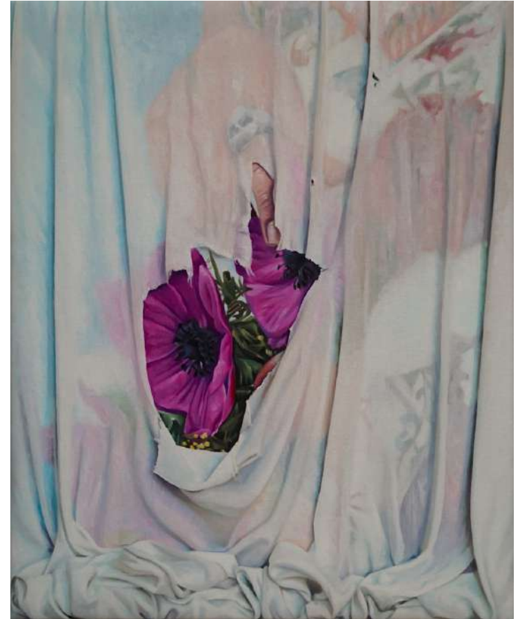
Linteum Le jardin clos #2 -2022 16 x 12,9 in oil on canvas

She plays on resemblances, dissonances, intimacies. Everything is on the surface, everything seems simple, however something crooked leads us through the looking-glass, making her work so remarkable.