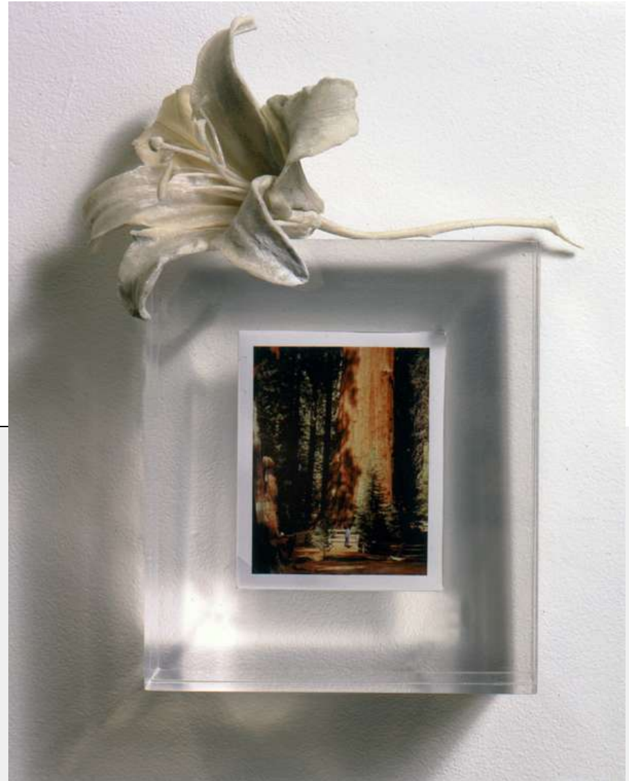
Flower Flower cast in Welburtrin and polaroid 12 x 10 x 4.5 inches