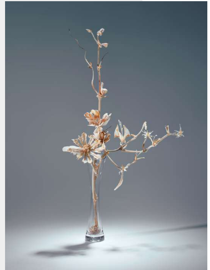
Ikebana 1, 2022 Poultry bones