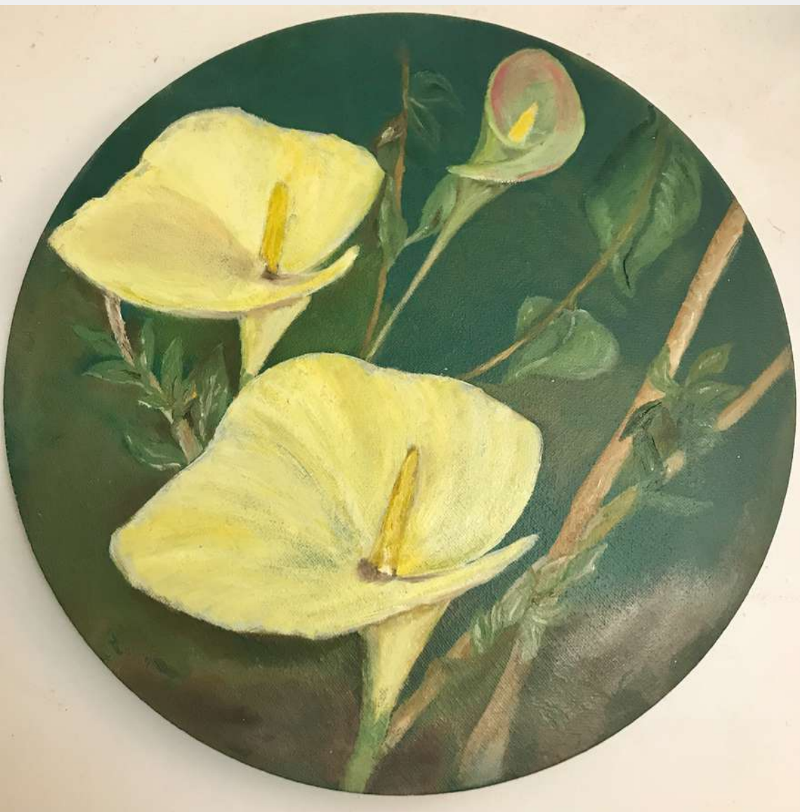
Fleurs, 2022, diameter 11,8 in