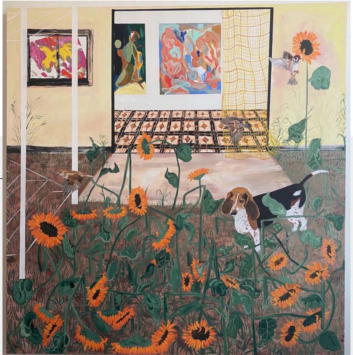
Peonies, Not Roses, 83.8cm x 71.1cm Acrylic, 2022