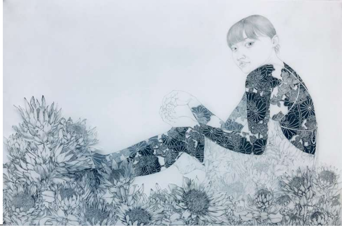
Lush Life, 2019, graphite and oil, 19,69 x 29,92 in

Fay Ku's flowers and birds arrived through textiles and traditional east Asian art, often employed as a projection of her character's psychology or symbolic of some societal turmoil. In Desert Is My Home , inspired by Thomas Kunin's Old Crack Tune , the bleakness of the desert (as a metaphor) contrasts with the rich inner life—and the water-based lotus plant—so that the vegetation is imprinted literally on the protagonists in the form of tattoos. In Lush Life , the protagonist also has tattoos, and her clothing continues with the vegetation (cut out and glued so that it is dimensional) that surround her. Although visually different, the philosophy is not unlike the Chinese literati pure ink landscapes where there is always a tiny human within the grand scene of nature (which are most often done not in plein air, through observation, but instead through memory or imagination). There is no separation of nature and humans—humans are nature.