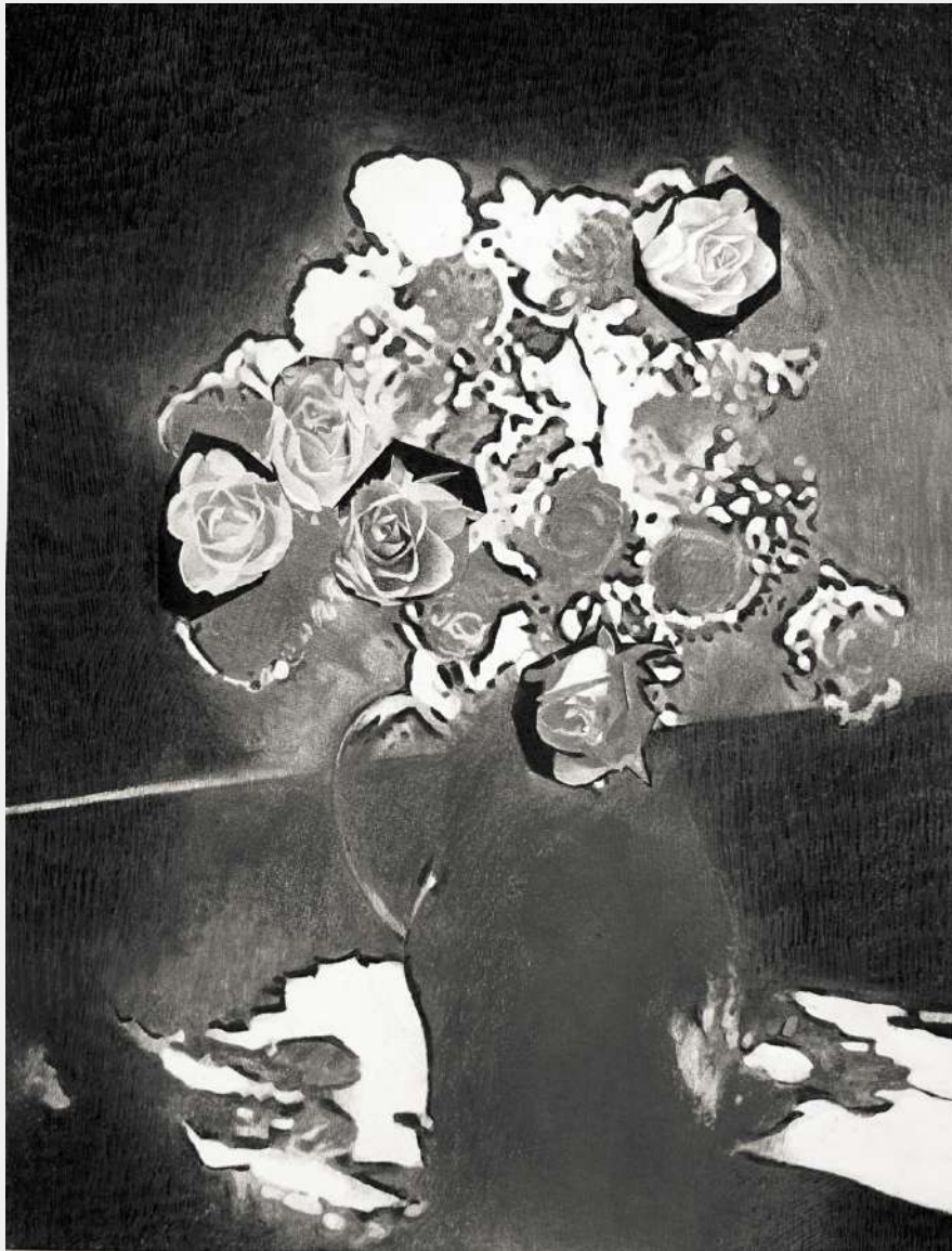
Bouquet #3 2022 27,6 19,7 in Graphite and black stone on paper