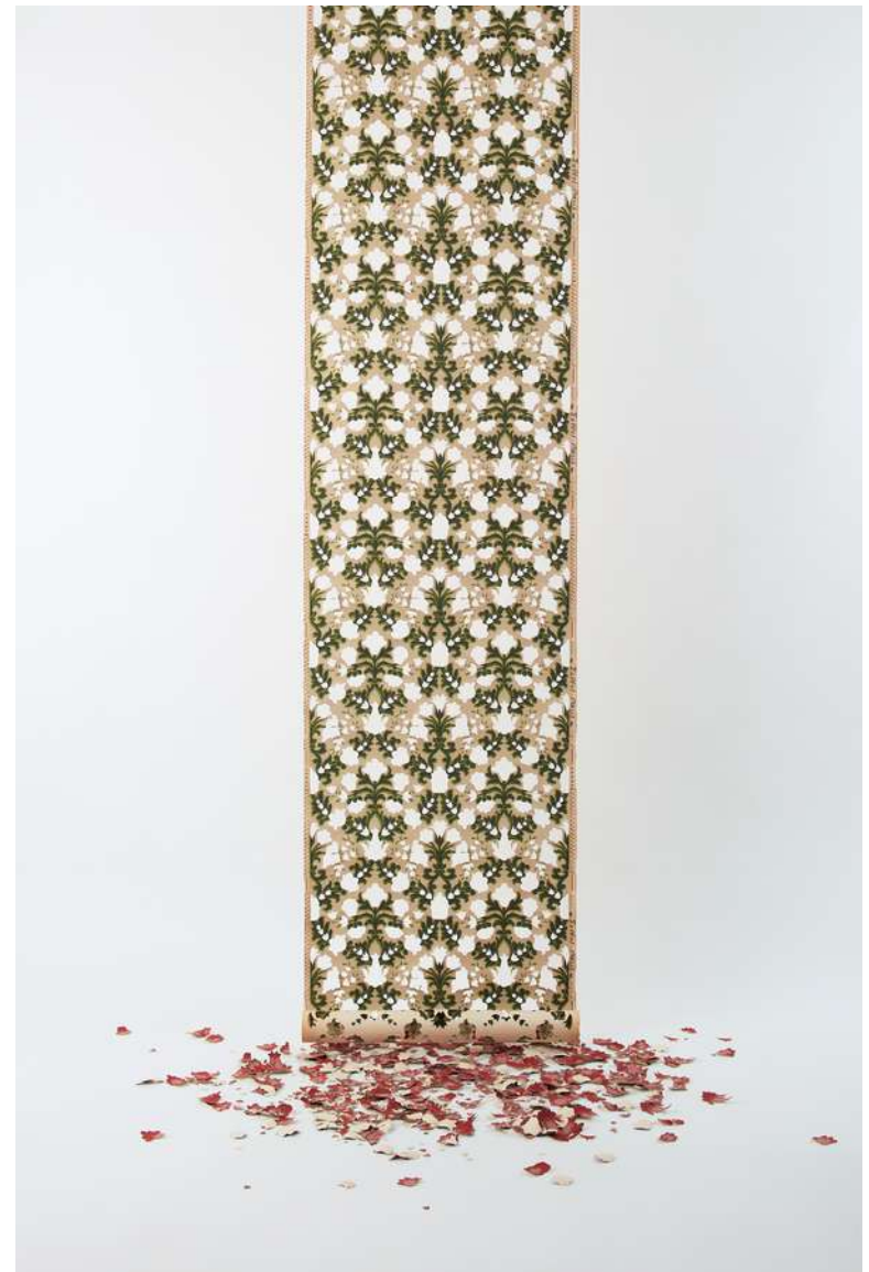
« Défloration » Papier peint découpé 2022

"Défloration" is an image of global chaos, evoking the extinction of species and nature. "I chose a luxurious handcrafted paper that was made by Paul Follet, a French cabinet-maker and decorator specialized in flowers in the 1920's, to pull every flower out like all the violence inflicted to our world, resigning to letting it die".