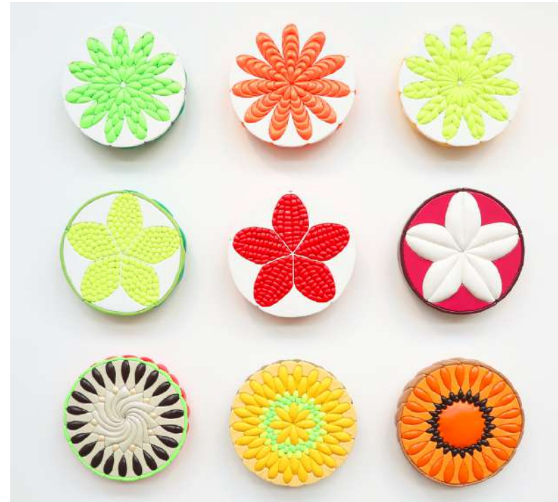
Slices, mixed medium, 2022

Exhibitions (selection): Royal Monastery of Brou in Bourg-en-Bresse, Bellerive Museum of Zürich, Rijswijk Museum in Amsterdam, National Center for Craft and Design in Sleaford (UK), Jean-Lurçat and contemporary tapestry Museum in Angers, Les 3 CHA Art Center in Châteaugiron and the Manufacture of Roubaix, the Memory Museum and textiles Museum.