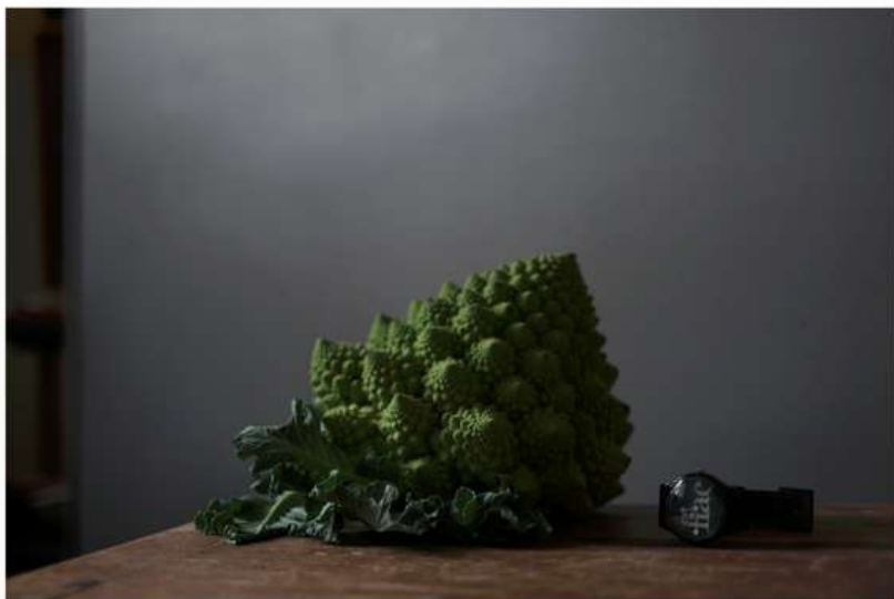
still, 2020 et 2022 Prints by Fine art ultra mat, show frame 11,8 x 15,7 each