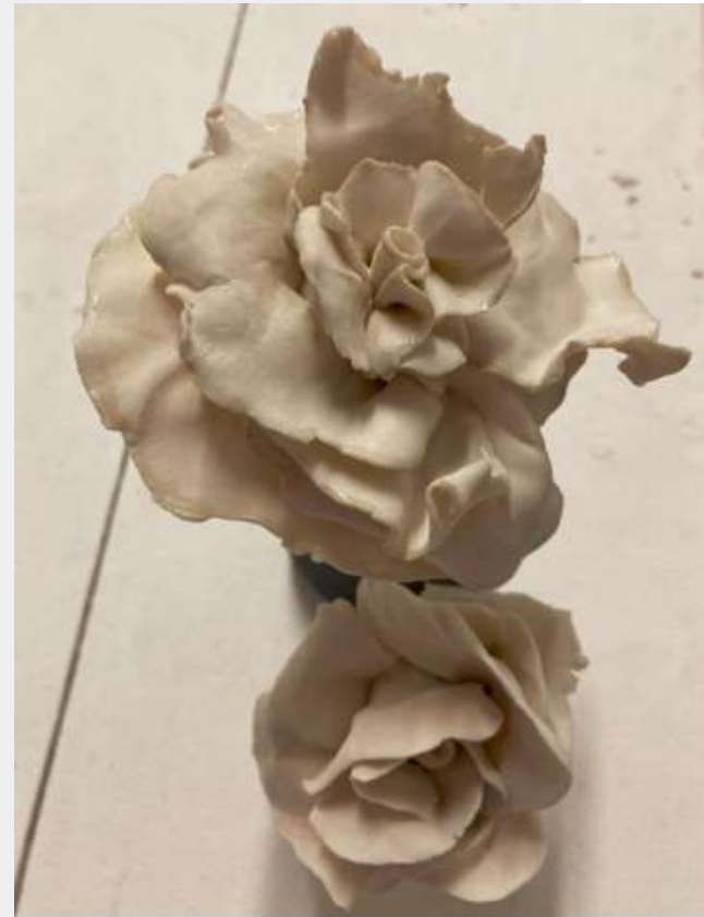
Fleurs céramique, 2022

"In wild life lies the protection of the world" - H.D. Thoreau