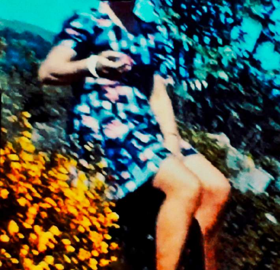
More False Memories (L'enfance) Photography, print by Fine Art