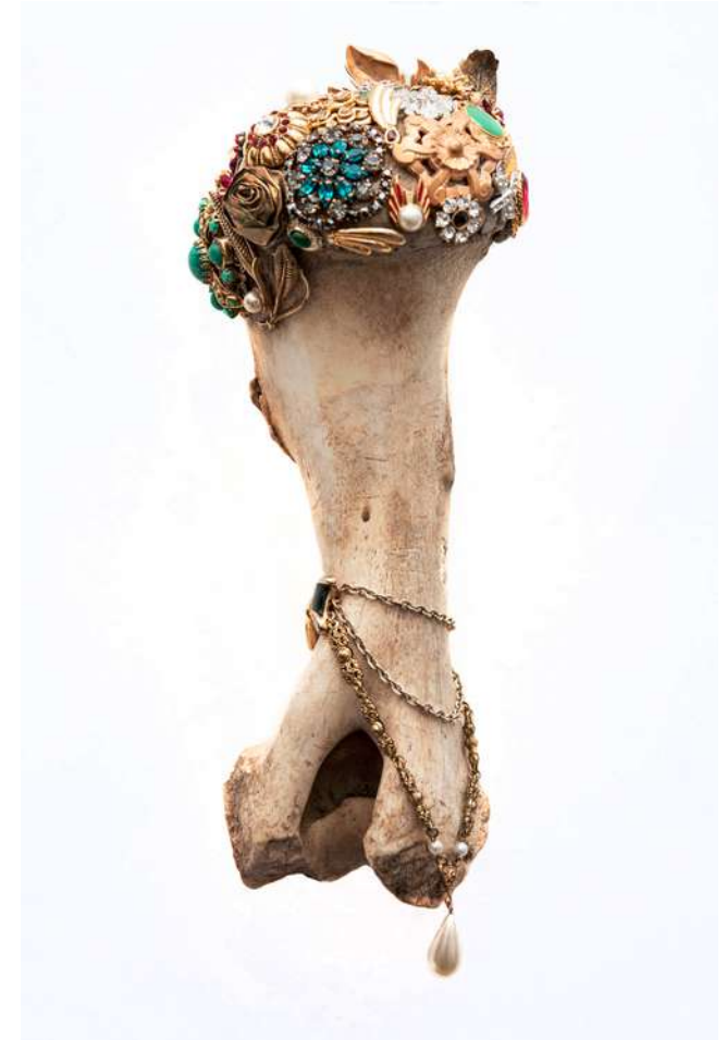
Le bouquet de la mariée 3 (Bridal bouquet)