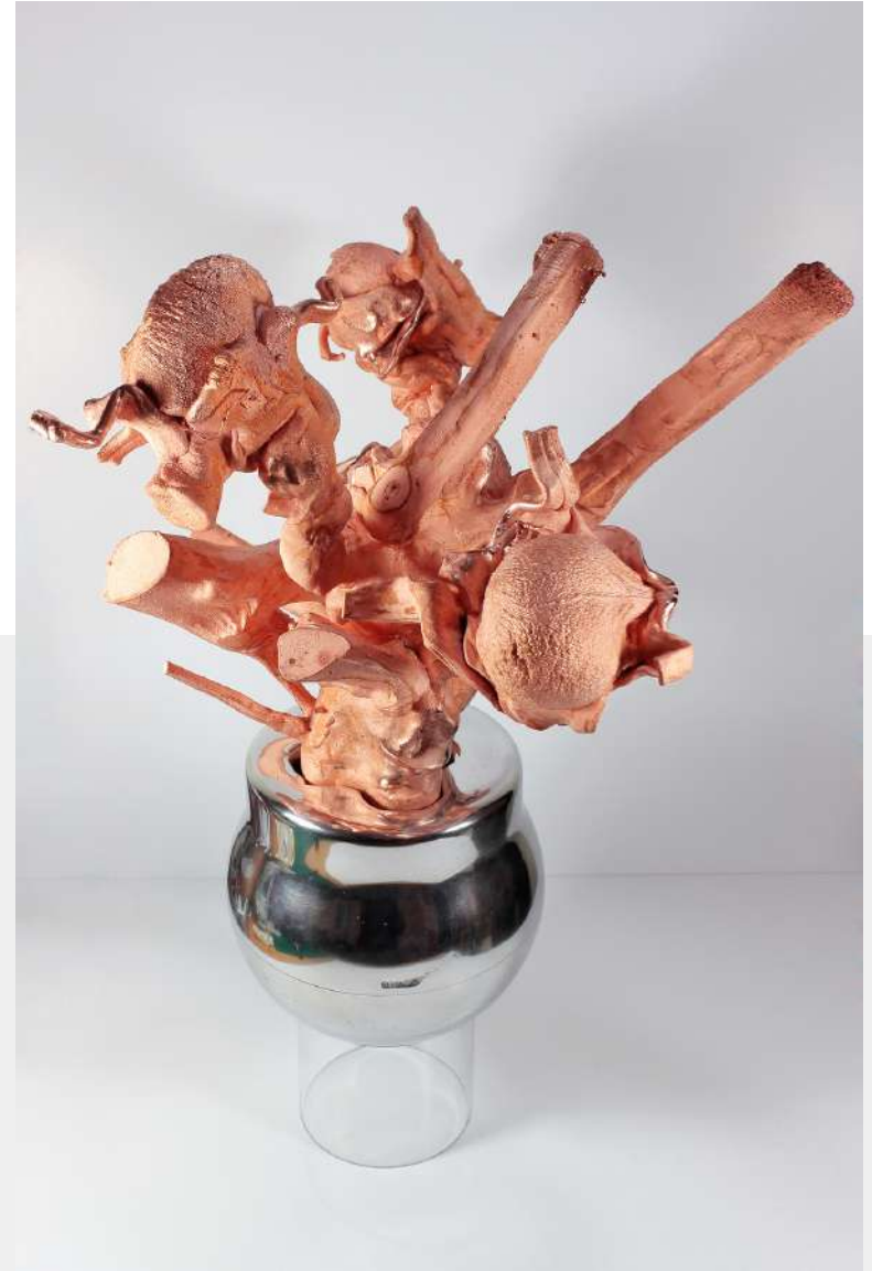
Poussé-e, aluminium coulé, polycaprolactone plaqué cuivre, 50x40x40cm. 2022

Exploring our frames of reference that block our porosity to our being part of the world, Yann Derlin looks for answers to the following question: how did we become our own pets ?